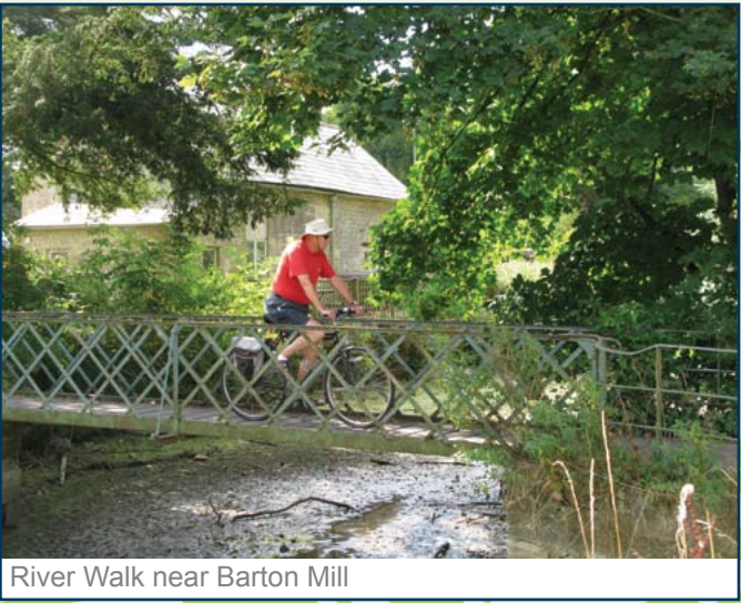
River Walk near Barton Mill