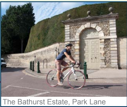
The Bathurst Estate, Park Lane